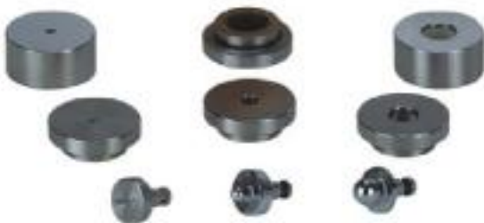
Fig. 1 Test Tools

This Sheet and Strip Metal Testing Machine is especially designed for an easy and quick quality conformance inspection and quality control on sheet and strip metal, but also particularly suitable for production monitoring because of its sturdy construction.