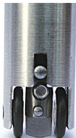
Rolling test head „435 S“ with test tool