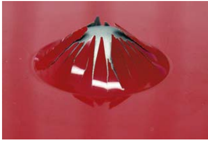
DIN EN ISO 1520