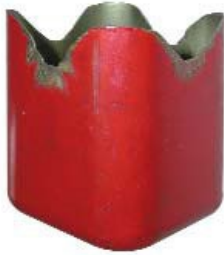
Square Cup Test