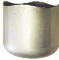
Deep Drawing Cup Test